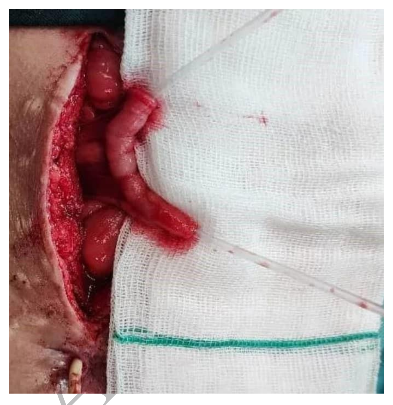
Figure 1. Appendix patency with the 10F catheter.